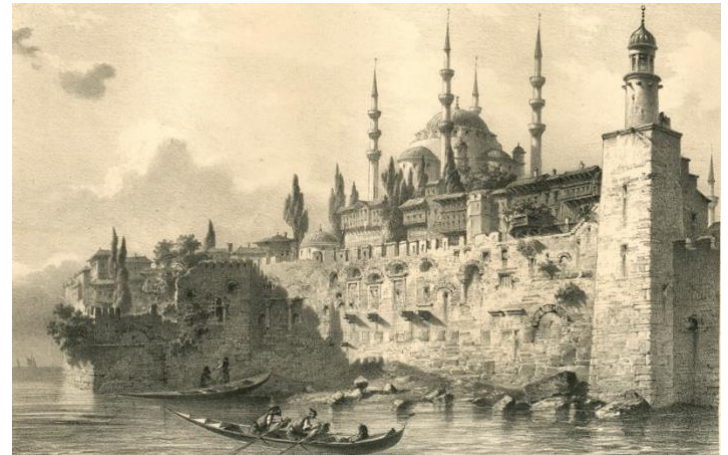
Bucoleon Palace by Eugene Flandin, 1853

We will focus on the historical peninsula, recognized as an UNESCO World Heritage Site and an archeological site, which will allow us to thoroughly examine the multifaceted and layered characteristics of architecture built upon the remains from different historical periods that continue to influence the city's landscape. We will observe functional layers such as water, creed, trade, defense and housing systems in connection with the historical layers of Roman, Byzantine, Ottoman, and Republican eras. By zooming in on the Bucoleon Palace, a unique site from Roman that has not yet been opened to visitors, we will have the opportunity to see the transformation at the building scale . We will rethink the spatial, material, technical and ecological characteristics by experiencing the traces of the past and phenomena of the now. The urban scale transformation will be experienced through exploration of the area bordered by the Bucoleon Palace and the Hippodrome. We will create exciting routes with traces of different times in relation to everyday life.