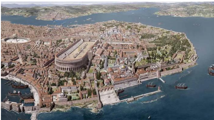
Constantinople and its sea walls, with the Hippodrome, Great Palace, and Bucoleon Palace (10th century), by Antoine Helbert www.countrycaravans.co.uk

The second phase of the study trip includes two short workshops, in addition to the city tours, focused on gathering data as the foundation of the final product that will be developed in the third phase . The first phase will equip participants with the methods and tools needed for the second phase; the trip to Istanbul. As for the final outcome, it will involve "deep mapping" as an individual expression based on data collected by the teams. We will explore mapping as a tool for architectural design from an experiential aspect, drawing on insights from Heideggerian phenomenology and the critiques of Donna Haraway and Doreen Massey. This approach is based on the idea that architects can utilize this experiential understanding shaped by the traces of time and presence in a specific place, to design spaces.