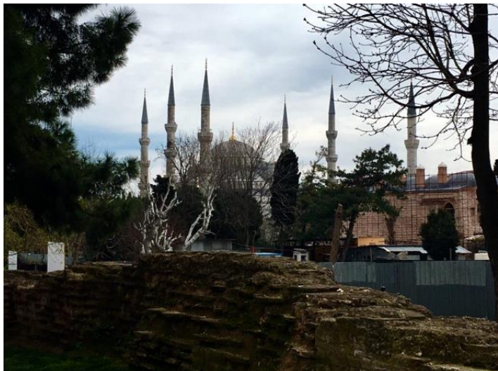
Remains of the Great Palace of Constantinople, with the Blue Mosque and the Hürrem Sultan Turkish Bath at the background. Photograph by Ulgen Özgül, 2022